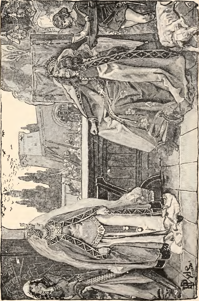
THE QUARREL OF THE QUEENS.