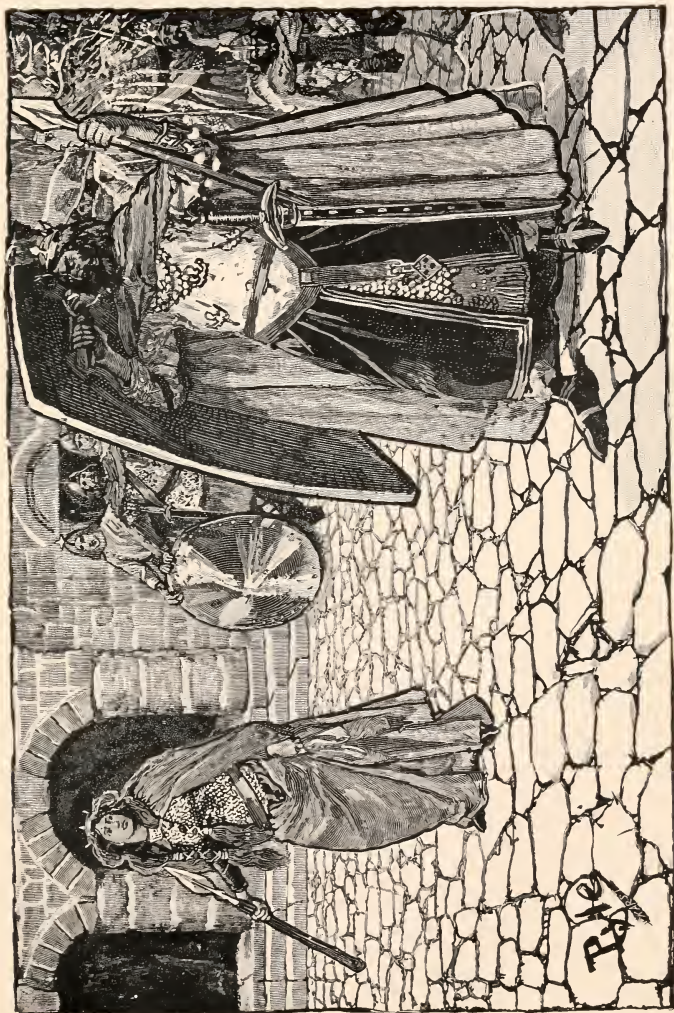
THE TRIAL OF STRENGTH