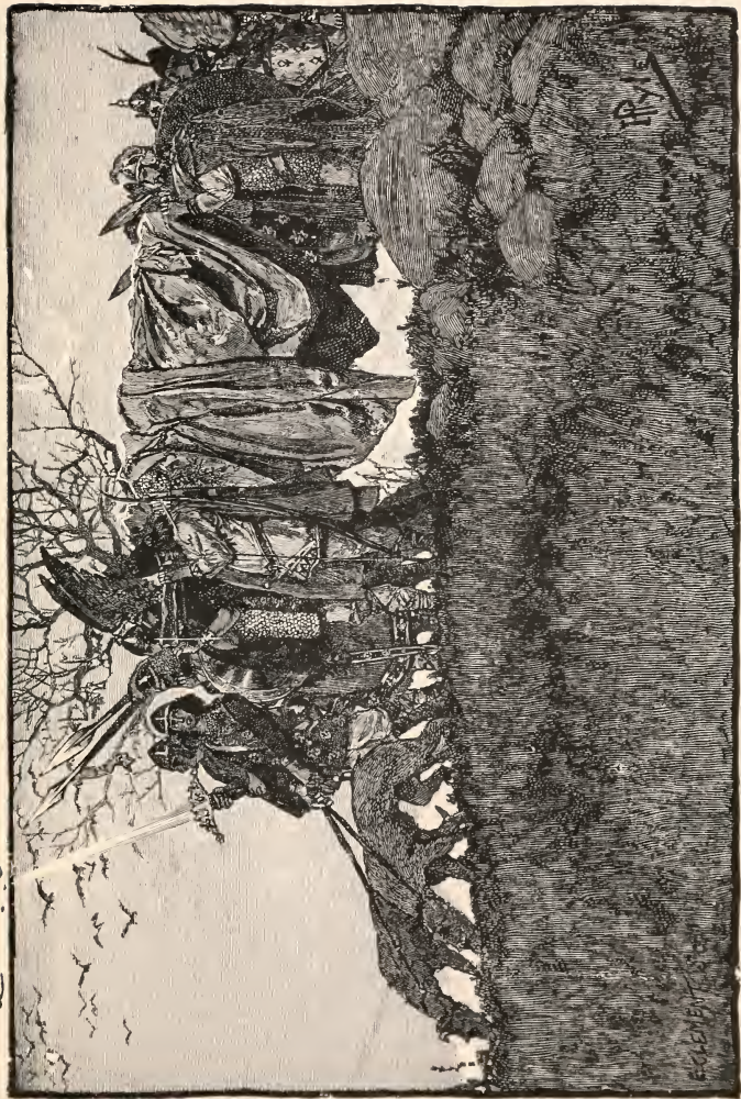
THE DEATH OF SIEGFRIED