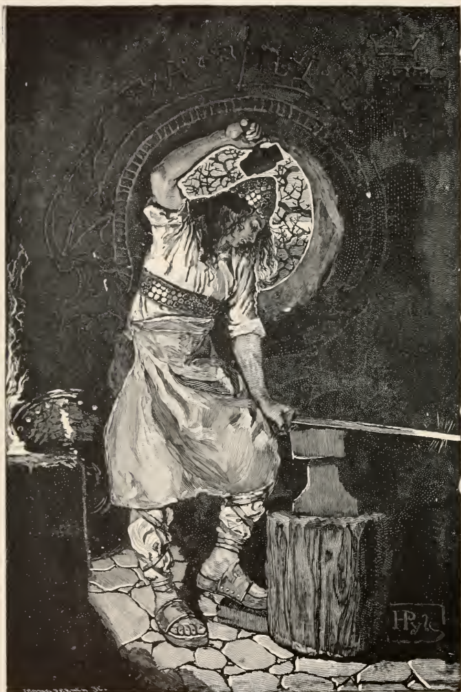
THE FORGING OF BALMUNG