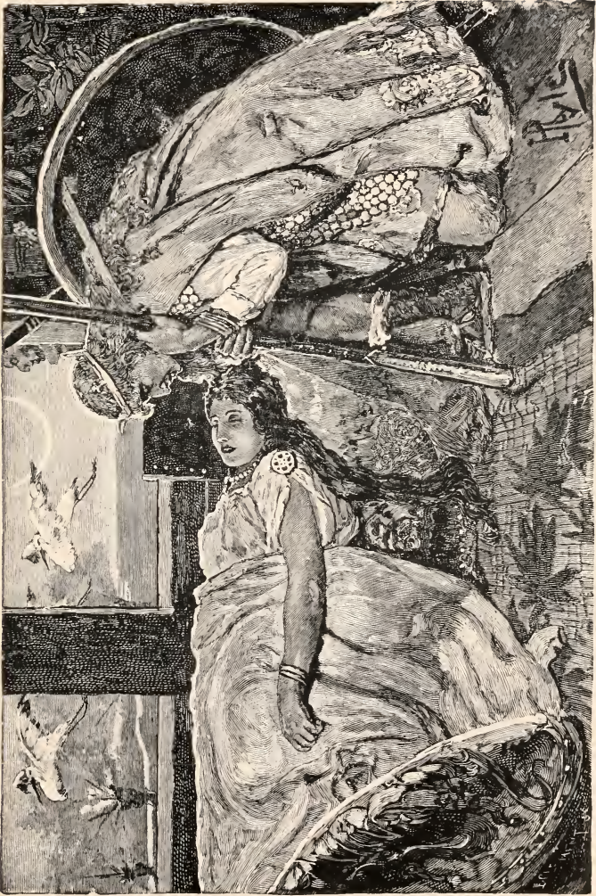
THE AWAKENING OF BRUNHILD