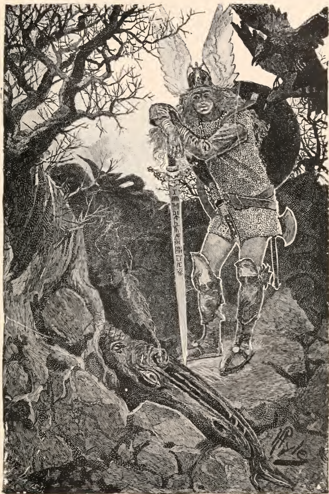
THE DEATH OF FAFNIR.